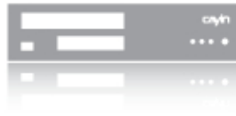
CONTENT MANAGEMENT SERVERS